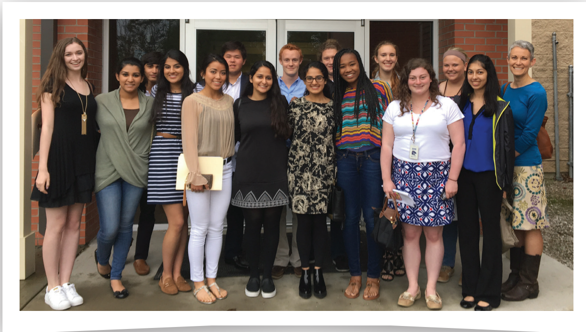
2016 Artemis Fund Board of Trustees

By supporting the fund, you are helping to create future leaders out of the students participating in the philanthropy class at Kentucky Country Day School. With your support, the students are able to experience the world of philanthropy in a hands-on, unique way, and learn about the core values involved in charity. As a part of the everyday class, students get to hear from a wide array of class speakers involved in the non-profit world, and develop a firm understanding of how philanthropy has evolved and changed over the years. In addition, students have the opportunity to serve on the Board of Trustees for The Artemis Fund by raising money for the endowment to distribute to the chosen organizations that applied for grants.